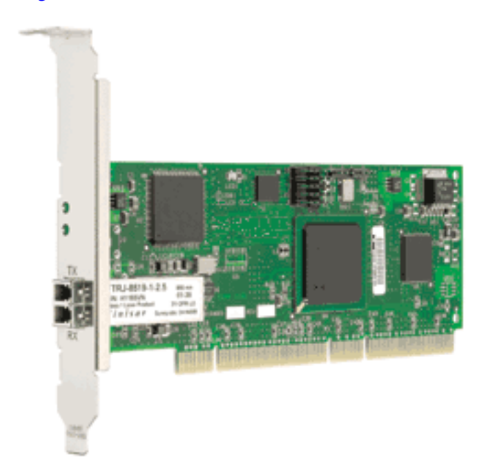
Figure 1 illustrates the AB232A HBA.